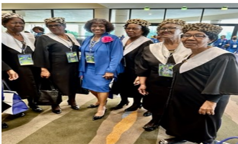
(Photograph with the WMS of South Africa)