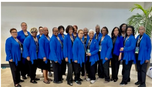
(The VA Conference attired in blue and on our way to the day's Business Session)