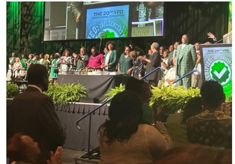
(YPD Business Meeting)

One of the highlights was a visit from the Vice President of the United States -Kamala Harris who thanked the AME Church for its steadfast work on Social Justice, the backbone of our Democratic Society.