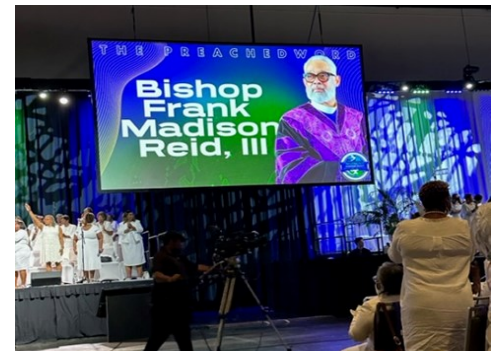
(The host Bishop of the YPD/WMS Quadrennial)