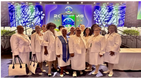
(Night in white - the VA Conference Delegation)